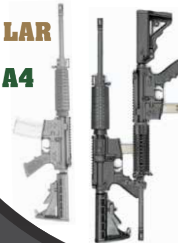
RRA LAR 6.8 CAR A4