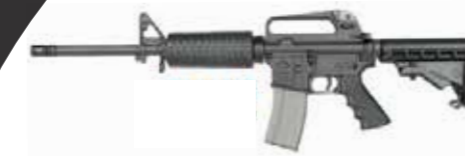
RRA LAR 15LE Car & Mid-Length A2

CALIBER 5.56mm NATO Chamber for 5.56mm & .223 Cal LOWER RECEIVER Forged RRA LAR-15® Lower Receiver UPPER RECEIVER Forged A2 Upper Receiver BARREL Chrome Lined 16 Inch Lightweight, 1:9 Twist MUZZLE DEVICE A2 Flash Hider / 1/2-28 Thread TRIGGER Standard Single Stage HANDGUARD Mid-Length Handguard BUTTSTOCK RRA 6-Position Tactical CAR Stock PISTOL GRIP A2 Grip Pistol Grip WEIGHT / LENGTH 7.5 pounds / 35.25 inches ACCURACY 1.5 MOA at 100 yards ACCURACY One Mag, Case, Sling, Manual, Warranty