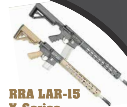
RRA LAR-15 X-Series X-1 Rifle