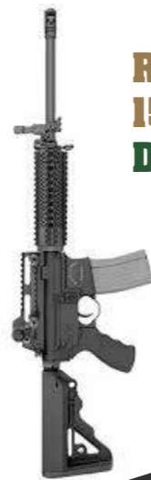
RRA LAR 15LE Delta CAR

CALIBER 5.56mm NATO Chamber for 5.56mm & .223 Cal. LOWER RECEIVER Forged RRA LAR-15® Lower UPPER RECEIVER Forged A4 Upper BARREL 16 Inch Chrome Moly HBAR, 1:9 Twist MUZZLE DEVICE A2 Flash Hider / 1/2-28 Thread GAS BLOCK Low Profile Gas Block TRIGGER / TRIGGER GUARD RRA Two Stage / Winter Trigger Guard BUTTSTOCK RRA Delta CAR Stock PISTOL GRIP ERGO SureGrip HANDGUARD RRA Delta Quad Rail Mid-Length Two Piece Drop-In WEIGHT / LENGTH 7.3 Pounds / 33 Inches Retracted / 36.75 Inches Extended ACCURACY 1 MOA at 100 yds INCLUDED One Mag, LPS-1 Weapon Wipe, RRA Case, Manual, Warranty