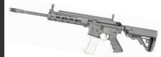
RRA LAR-15 IRS CAR

TRIGGER / TRIGGER GUARD RRA Two Stage / Winter Trigger Guard BUTTSTOCK / PISTOL GRIP RRA 6-Position Tactical CAR Stock HANDGUARD RRA IRS, CAR Length, with Integral Folding Sights WEIGHT / LENGTH 7.6 Pounds / 34.5 Inches, 38 Inches Extended ACCURACY 1 MOA at 100 yds INCLUDED One Mag, LPS-1 Weapon Wipe, RRA Case, Manual, Warranty