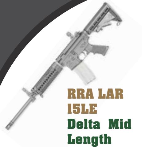
RRA LAR 15LE Delta Mid Length

CALIBER 5.56mm NATO Chamber for 5.56mm & .223 Cal. LOWER RECEIVER Forged RRA LAR-15® UPPER RECEIVER Forged A4 Upper BARREL 16 Inch Chrome Moly, 1:9 Twist MUZZLE DEVICE A2 Flash Hider / 1/2-28 Thread TRIGGER RRA Two Stage SAFETY SELECTOR Star Safety PISTOL GRIP Hogue Rubber Grip BUTTSTOCK RRA 6-Position Tactical CAR Stock HANDGUARD Mid-Length Handguard WEIGHT / LENGTH 7.7 Pounds / 36 Inches ACCURACY 1 MOA at 100 Yards INCLUDED One Mag, LPS-1 Weapon Wipe, RRA Case, Manual, Warranty