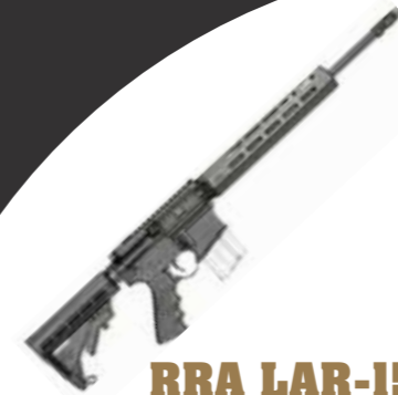
RRA LAR-15 Lightweight XL

CALIBER 5.56mm NATO Chamber for 5.56mm & .223 Cal. LOWER RECEIVER Forged RRA LAR-15® Lower UPPER RECEIVER Forged A4 Upper BARREL 16 Inch Chrome Moly Lightweight, 1:9 Twist MUZZLE DEVICE A2 Flash Hider / 1/2-28 Thread GAS BLOCK Low Profile Gas Block TRIGGER / TRIGGER GUARD RRA Two Stage / Winter Trigger Guard BUTTSTOCK RRA 6-Position Tactical CAR Stock PISTOL GRIP Hogue Rubber Grip HANDGUARD RRA Carbon Fiber Free Float, XL Length WEIGHT 6.1 Pounds LENGTH 32 Inches, 35.5 Inches Extended ACCURACY 1 MOA at 100 yds INCLUDED One Mag, LPS-1 Weapon Wipe, RRA Case, Manual, Warranty