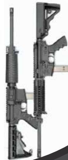
RRA LAR CAR A4 9