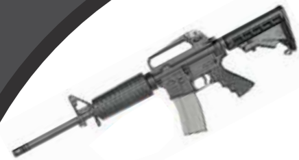
RRA LAR LE 15 R-4 Carbine