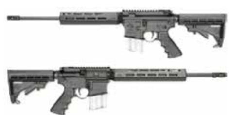
RRA LAR-300 X-Series X-1 Rifle

MUZZLE DEVICE RRA Beast or Hunter Muzzle Brake / 5/8-24 Thread GAS BLOCK Low Profile Gas Block TRIGGER RRA Two Stage / RRA Winter Trigger Guard PISTOL GRIP HHogue Rubber Grip - Black or Tan BUTTSTOCK RRA Operator A2 or RRA Operator CAR - Black or Tan HANDGUARD RRA TRO-XL Extended Length Free Float Rail - Black or Tan WITH OPER A2 STOCK : WEIGHT / LENGTH 7.9 Pounds / 38.5 Inches WITH OPER CAR STOCK : WEIGHT / LENGTH 7.8 Pounds / 36 Inches ACCURACY 1.5 MOA at 100 Yards INCLUDED One Mag, LPS-1 Weapon Wipe, RRA Case, Manual, Warranty