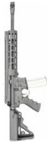
RRA LAR-15 IRS MID