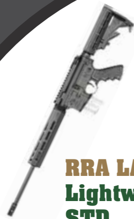
RRA LAR-15 Lightweight STD