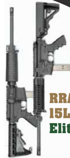
RRA LAR 15LE Elite CAR A4