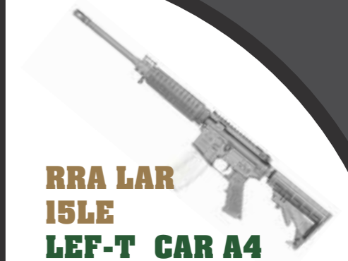
RRA LAR 15LE LEF-T CAR A4