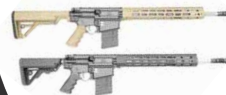
RRA LAR-458 X-Series X-1 Rifle

CALIBER 458 SOCOM Chamber LOWER RECEIVER Forged RRA LAR-15® UPPER RECEIVER Forged A4 Upper BARREL 18" Fluted Bead Blasted Stainless Bull, 1:14 Twist, Cryo Treated MUZZLE DEVICE RRA Beast or Hunter Muzzle Brake / 5/8-32 Thread GAS BLOCK Low Profile Gas Block TRIGGER RRA Two Stage / RRA Winter Trigger Guard PISTOL GRIP HHogue Rubber Grip - Black or Tan BUTTSTOCK RRA Operator A2 or RRA Operator CAR - Black or Tan HANDGUARD RRA TRO-XL Extended Length Free Float Rail - Black or Tan WITH OPER A2 STOCK : WEIGHT / LENGTH 8.7 Pounds / 39.5 Inches WITH OPER CAR STOCK : WEIGHT / LENGTH 8.6 Pounds / 37 Inches ACCURACY 1.5 MOA at 100 Yards INCLUDED One Mag, LPS-1 Weapon Wipe, RRA Case, Manual, Warranty