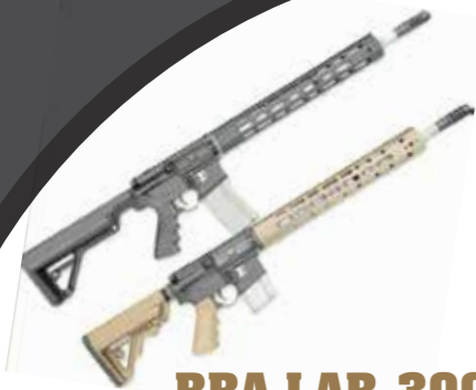
RRA LAR-300 X-Series X-1 Rifle