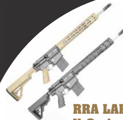
RRA LAR-8 X-Series X-1 Rifle

HANDGUARD RRA TRO-STD Rifle Length Free Float Rail - Black or Tan WITH OPER A2 STOCK : WEIGHT / LENGTH 59.5 Pounds / 40.5 Inches WITH OPER CAR STOCK : WEIGHT / LENGTH 9.5 Pounds / 39 Inches ACCURACY 1 MOA at 100 Yards INCLUDED One Mag, LPS-1 Weapon Wipe, RRA Case, Manual, Warranty