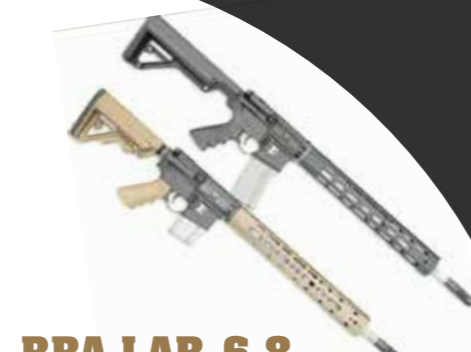
RRA LAR-6.8 X-Series X-1 Rifle

CALIBER .300 AAC Blackout LOWER RECEIVER Forged RRA LAR-300 UPPER RECEIVER Forged A4 Upper BARRE 18" Fluted Bead Blasted Stainless HBAR, 1:8 Twist, Cryo Treated MUZZLE DEVICE RRA Beast or Hunter Muzzle Brake / 5/8-24 Thread GAS BLOCK Low Profile Gas Block TRIGGER RRA Two Stage / RRA Winter Trigger Guard BUTTSTOCK RRA Operator A2 or RRA Operator CAR - Black or Tan PISTOL GRIP Hogue Rubber Grip - Black or Tan HANDGUARD RRA TRO-XL Extended Length Free Float Rail - Black or Tan WITH OPER A2 STOCK : WEIGHT / LENGTH 7.9 Pounds / 38.5 Inches WITH OPER A2 STOCK : WEIGHT / LENGTH 7.9 Pounds / 36.5 Inches ACCURACY 1 MOA at 100 Yards INCLUDED One Mag, LPS-1 Weapon Wipe, RRA Case, Manual, Warranty