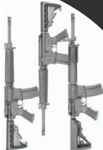
RRA LAR 6.8 Mid-Length A4